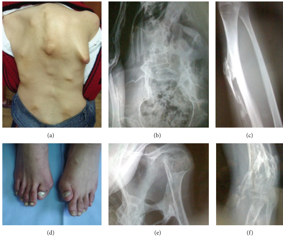
FIGURE 1: Clinical photograph. (a) Heterotopic ossification of the right scapular area, which functionally limited patient movement. Note the presence of pseudotumours of soft tissue at different locations in the back. (b) Column radiography showing abnormal calcification and “pseudoxostosis” indicating ligament ossification at the site of attachment. (c) Right forearm with cubit exostoses dependent on ligaments and aponeuroses. (d) Congenital malformations of the great toes. (e) Radiography of the right scapula and (f) right elbow shows abnormal calcification dependent on ligament ossification.

stated that the patient exhibited malformation of the great toes at birth. At the age of 8, the patient developed spontaneous and painful swelling in the right scapular area accompanied by a functional limitation of movement; her clinical laboratory abnormalities included increased serum alkaline phosphatase activity. Radiography demonstrated abnormal calcification and “pseudoxostosis” that was dependent on ligament ossification at the site of attachment to the long bones (Figure 1).